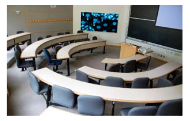
Digital signage in classrooms is helping facilitate communication and enhance the learning experience.